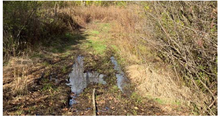
The ski trail has been rerouted away from this troublesome wet area.

Park staff mowed a revised route. Volunteers followed up with the Friends' new mini-excavator and some raking.