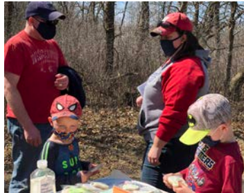
Outdoor Nature Center Program

At this time more than a million dollars have been raised toward the goal of approximately $4 million.