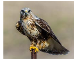
Circumpolar birds, like this Rough-legged Hawk, breed in the northern arctic and then migrate to southern Canada and northern US for the winter.

Track as many bird species as possible during a 24-hour period from within a single 17-foot circle. Learn more at: birdwatchersdigest.com/bwdsite/connect/bigsit/about.php .