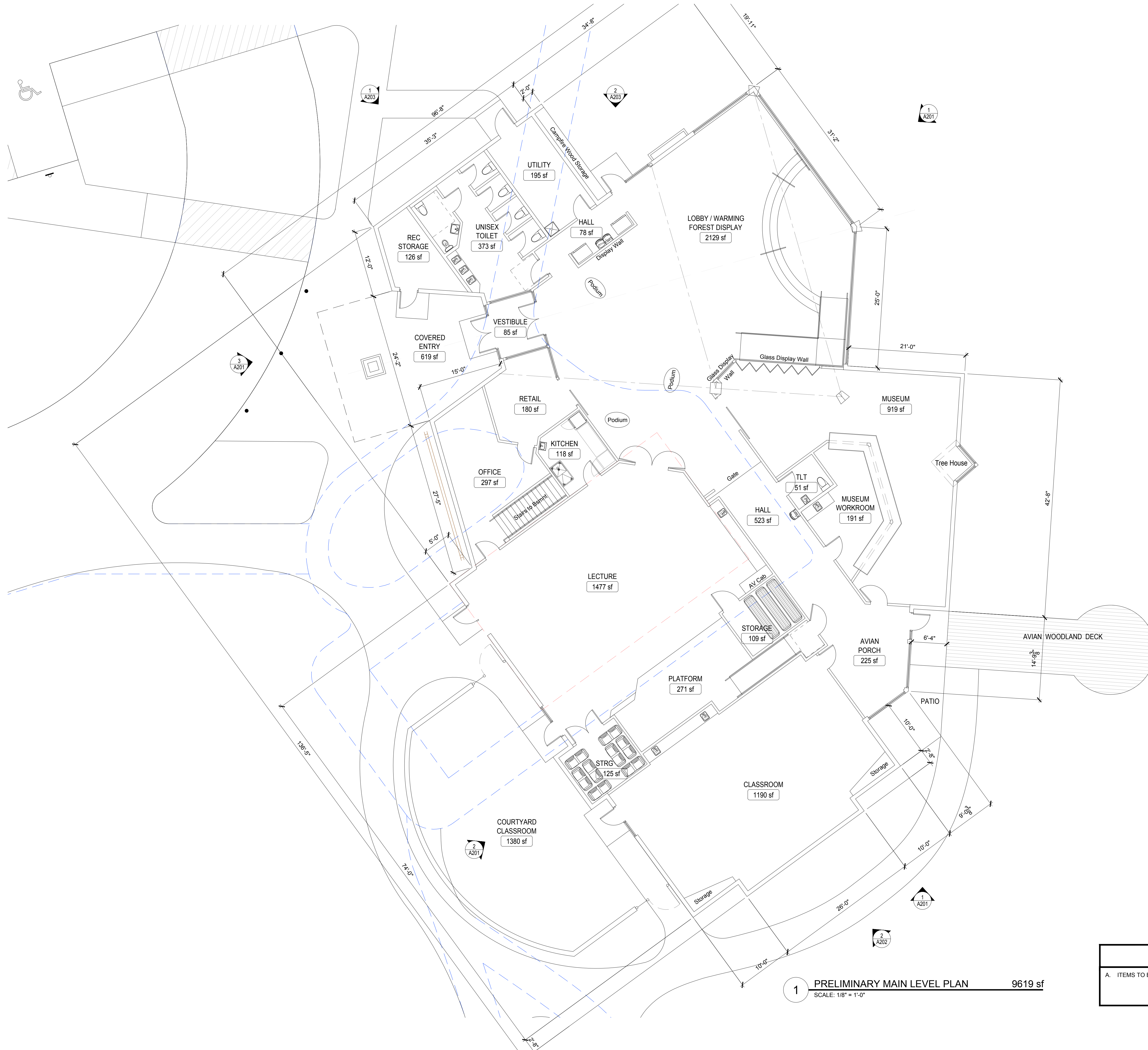
1 PRELIMINARY MAIN LEVEL PLAN 9619 sf SCALE: 1/8" = 1'-0"

GENERAL NOTES A. ITEMS TO BE DEMOLISHED ARE SHOWN DASHED BLUE