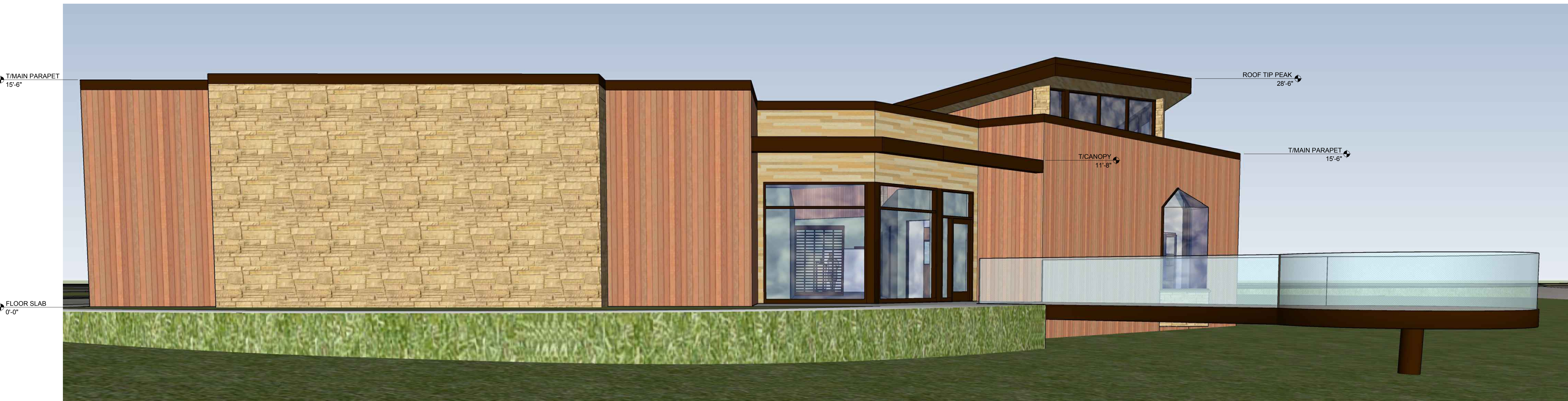
2 RIGHT REAR CORNER EXTERIOR ELEVATION SCALE: N.T.S.