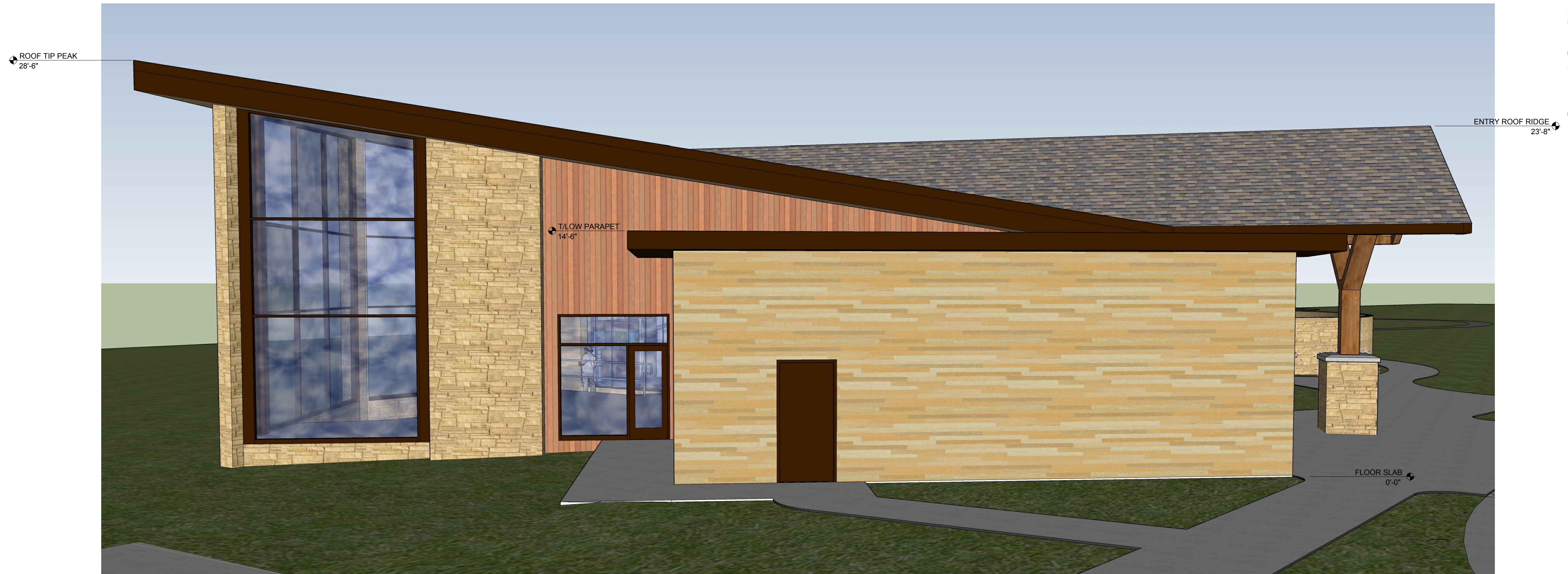
1 LEFT EXTERIOR ELEVATION SCALE: N.T.S.