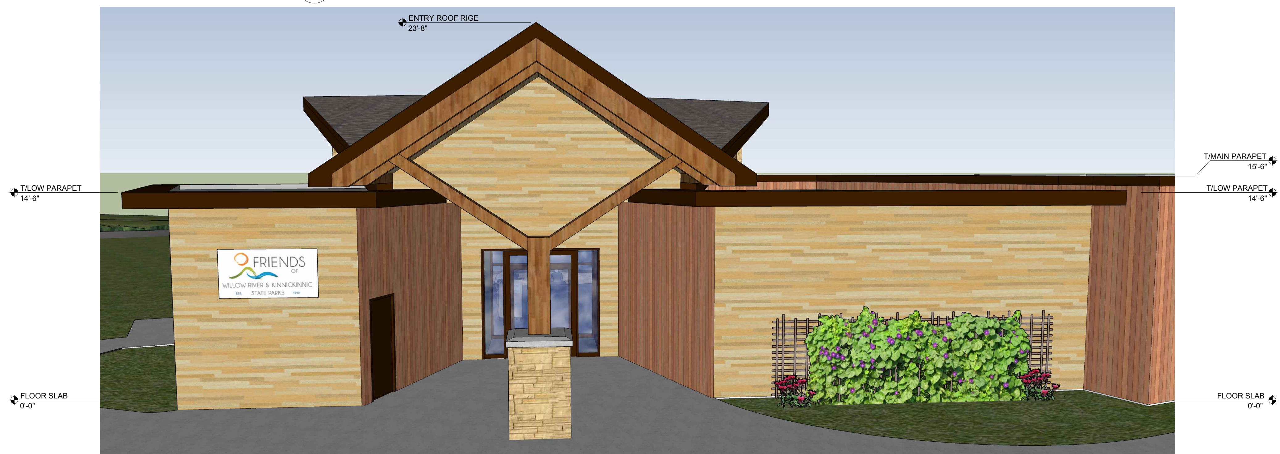
3 FRONT ENTRY EXTERIOR ELEVATION SCALE: N.T.S.