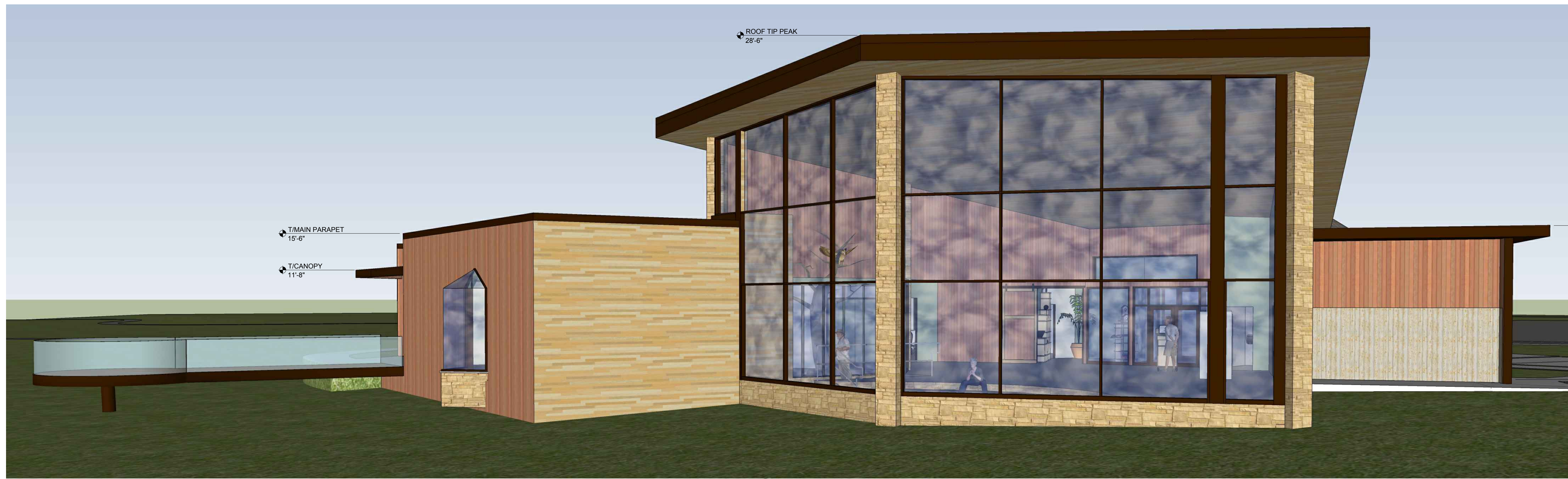
1 REAR EXTERIOR ELEVATION SCALE: N.T.S.