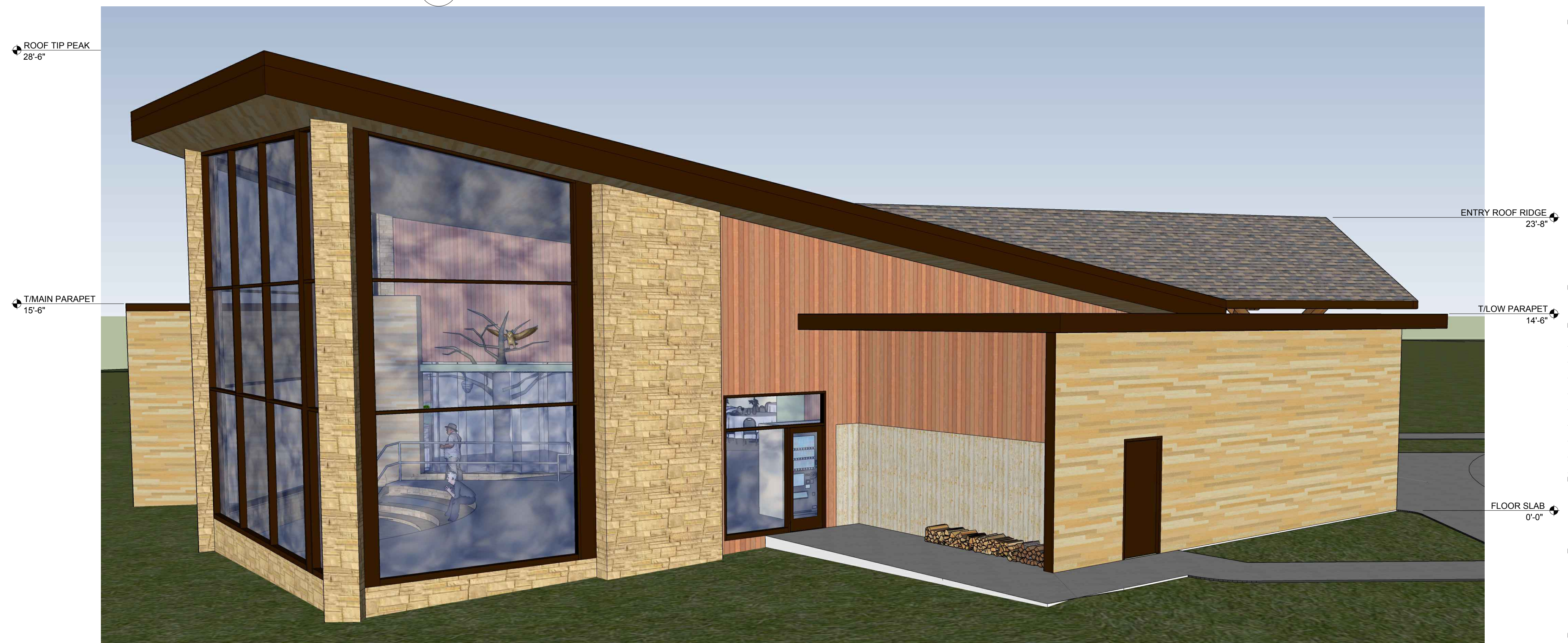
2 LEFT REAR CORNER EXTERIOR ELEVATION SCALE: N.T.S.