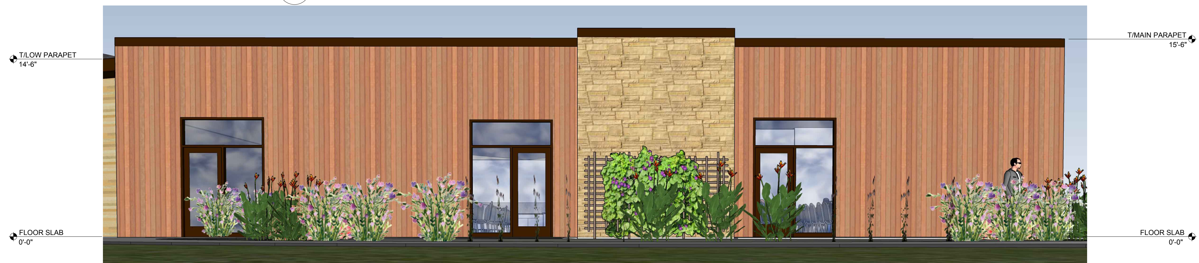
2 FRONT GARDEN AREA EXTERIOR ELEVATION SCALE: N.T.S.