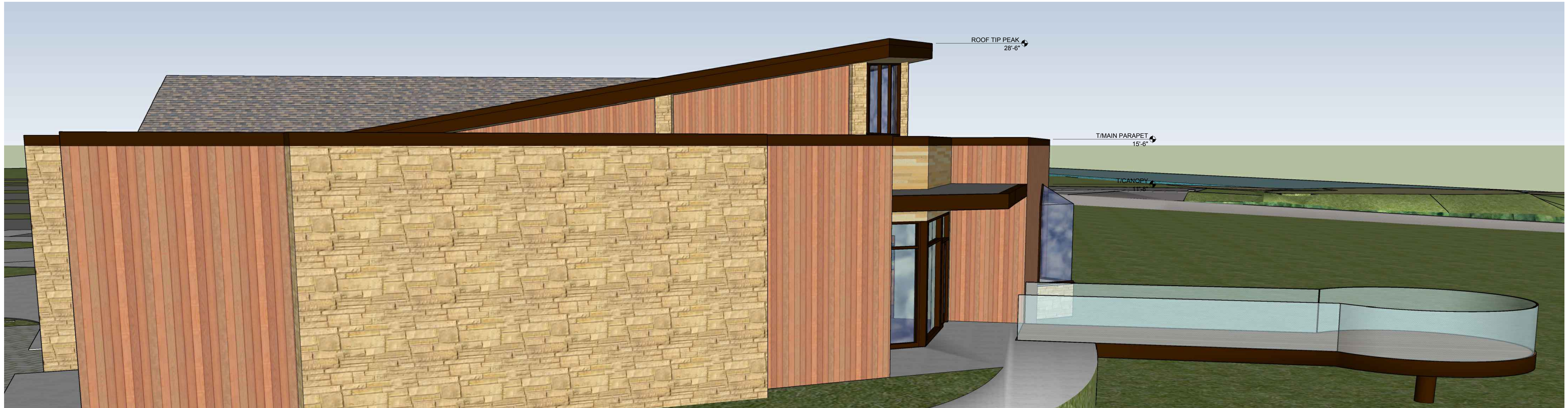
1 RIGHT EXTERIOR ELEVATION SCALE: N.T.S.